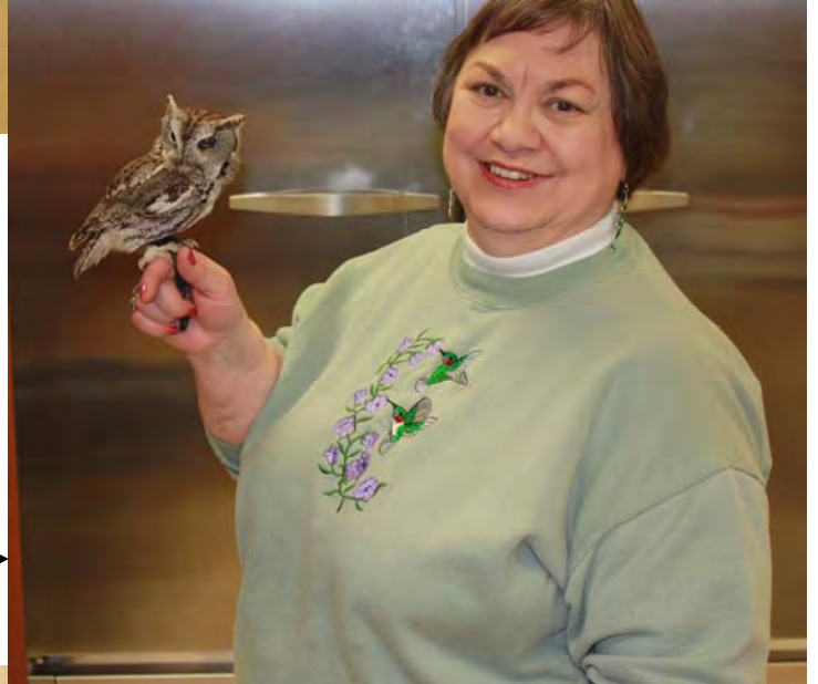
March Program Pictures