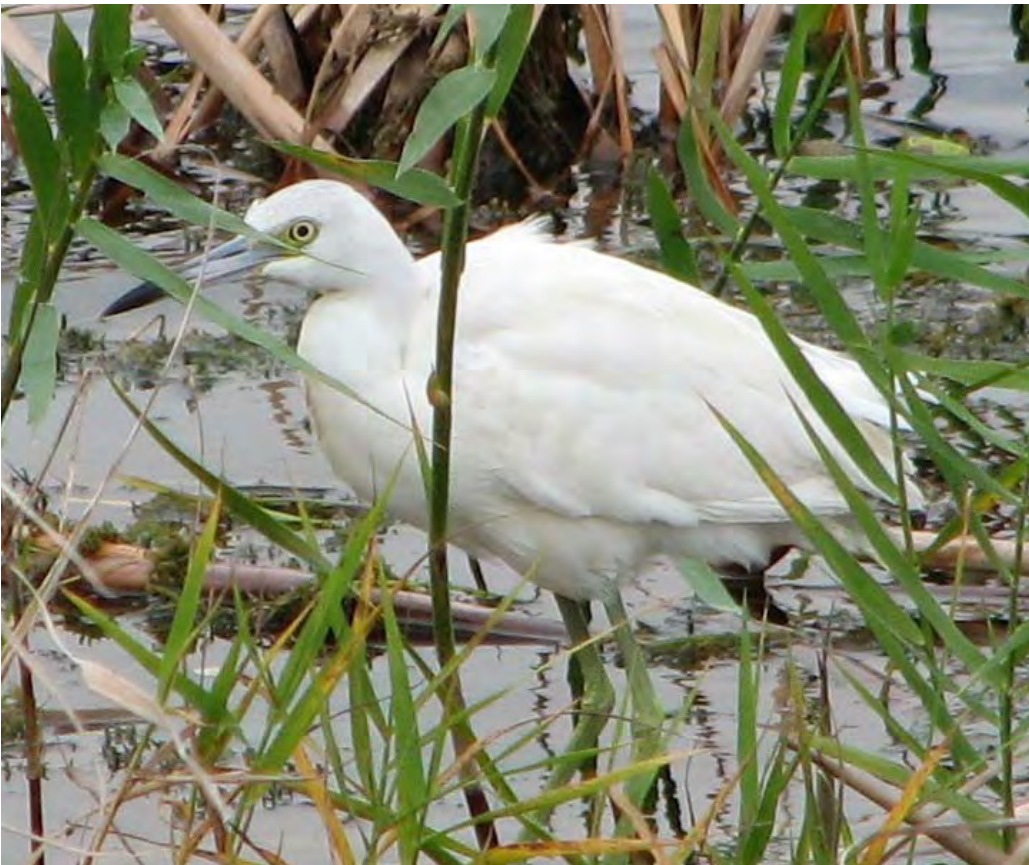
↑ Little Blue - White morph

Photos by Chad Brown Pictures from Florida