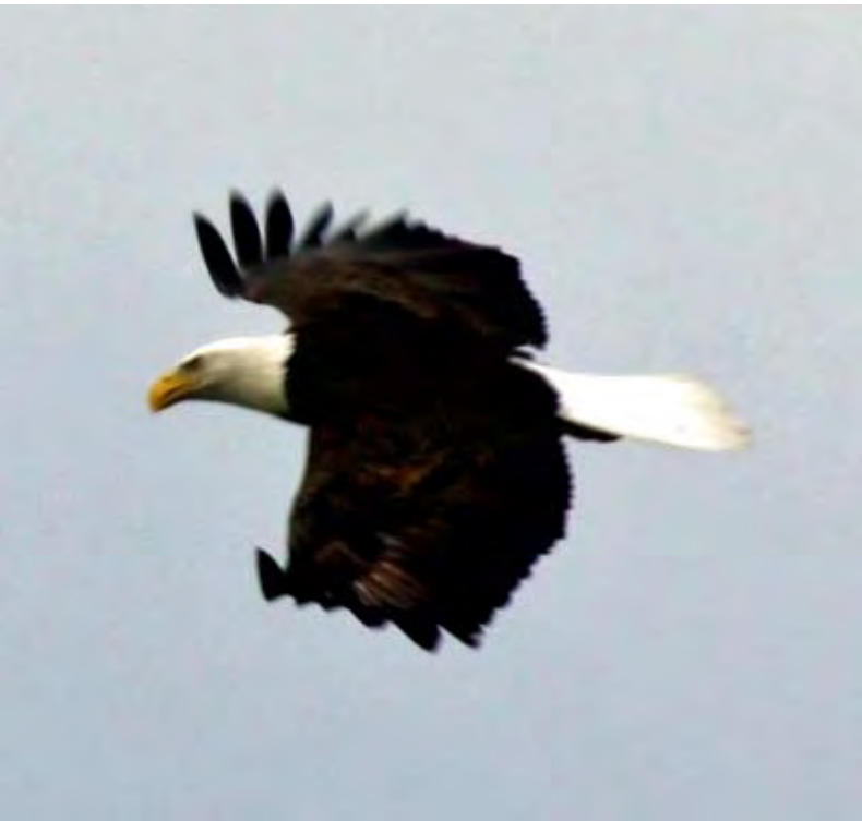
Adult Bald Eagle